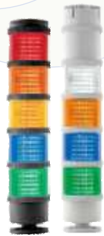
All modules are available with architecturally neutral white or basic black housings.