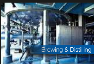
Brewing & Distilling